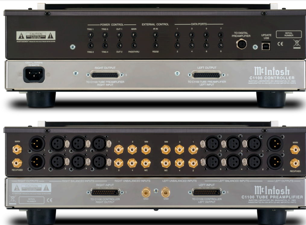
Top: Controller Bottom: Tube Preamplifier

Controller: 27 lbs (12.3kg) net, 43.5 lbs (19.7kg) in shipping carton; Tube Preamplifier: 25 lbs (11.3kg) net, 39.5 lbs (17.9kg) in shipping carton